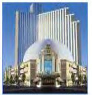
SILVER LEGACY RESORT