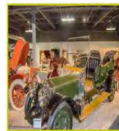
NATIONAL AUTOMOBILE MUSEUM